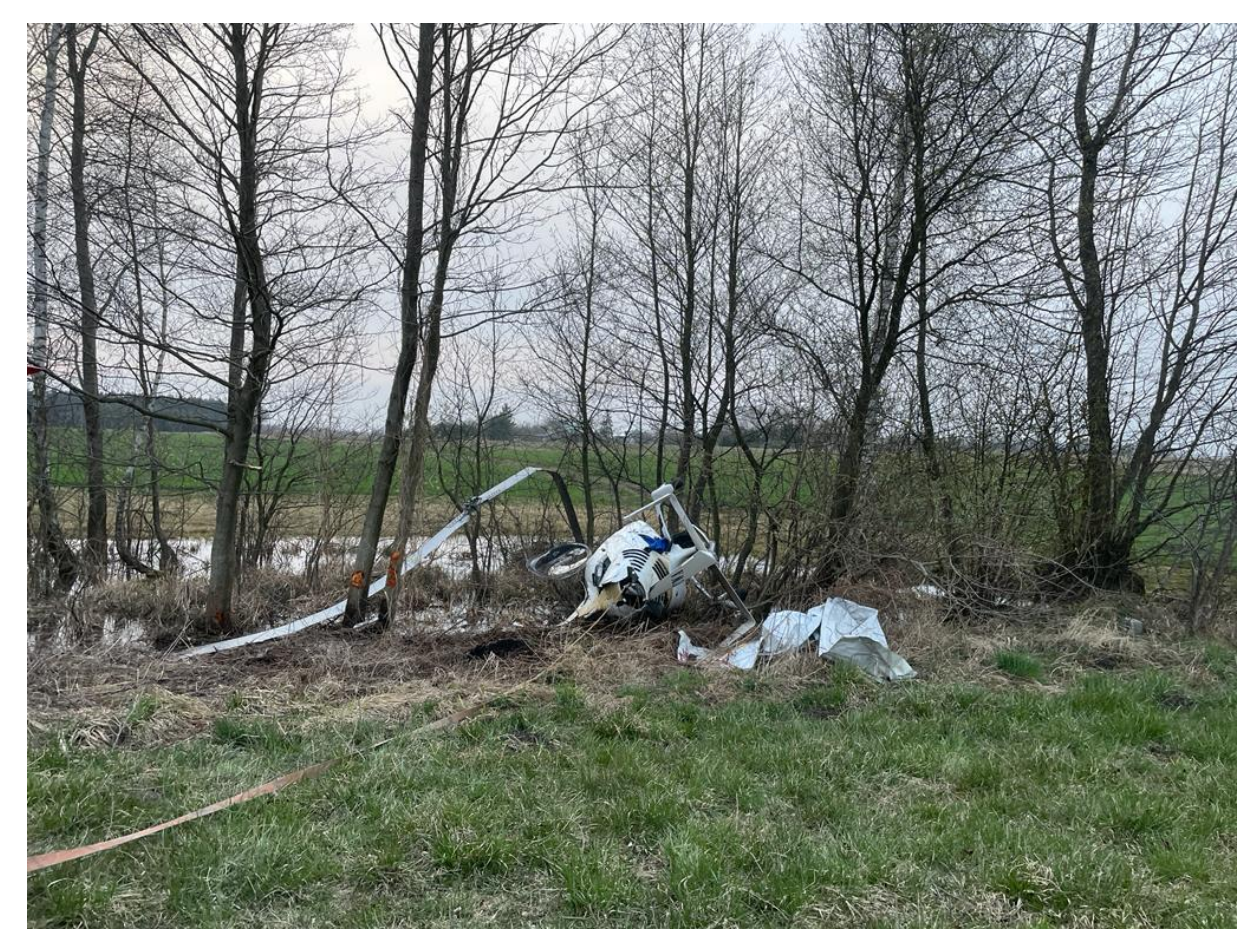
Fig. 2. SP-XCWA gyroplane at the accident site