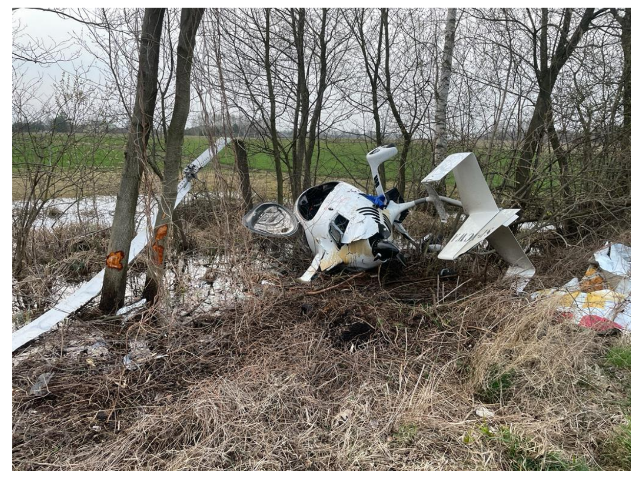
Fig. 1. SP-XCWA gyroplane at the accident site

The accident aircraft was destroyed. The nose landing gear strut was detached from the fuselage. As a result of the collision with trees, the two-blade main rotor and the blades of the push propeller were detached and damaged. The composite fuselage of the gyroplane was deformed and cracked. As the wreckage came to rest in a depression of wet terrain, the interior of the fuselage was partially penetrated by water.